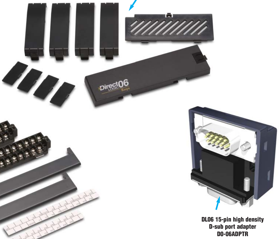
DL06 replacement terminal blocks, terminal block covers, terminal block labels and short bar D0-ACC-2